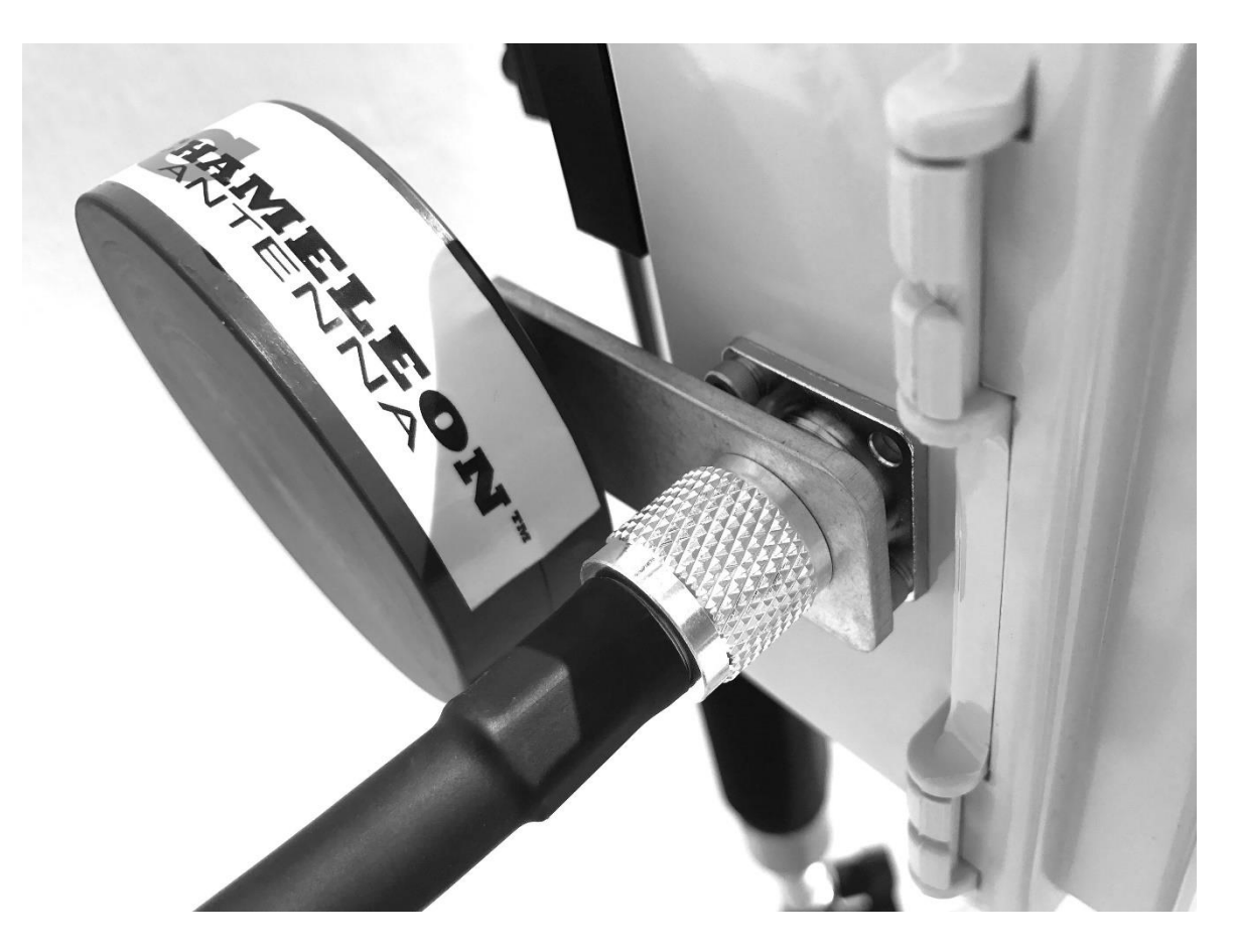
Plate 1. Chameleon Antenna<sup>™</sup> Magnetic Loop Antenna Power Compensator.

Thank you for purchasing and using the Chameleon Antenna<sup>™</sup> Magnetic Loop Antenna Power Compensator (CHA PC). The CHA PC, see Plate (1), is built exclusively by Chameleon Antenna<sup>™</sup> and increases the power handling capability of all Chameleon Antenna<sup>™</sup> magnetic loop antennas by 2 ½ times. It will also work with other brands of magnetic loop antennas that use a radiator loop with a UHF Connector (PL-259/SO-239). It is easy to install and will increase the utility of your portable magnetic loop antenna. Products built by Chameleon Antenna<sup>™</sup> are versatile, dependable, stealthy, and built to last.